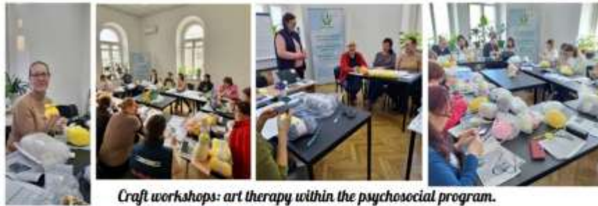
Craft workshops: art therapy within the psychosocial program.

focused on art-therapy and creative workshops for women facing multiple vulnerabilities.