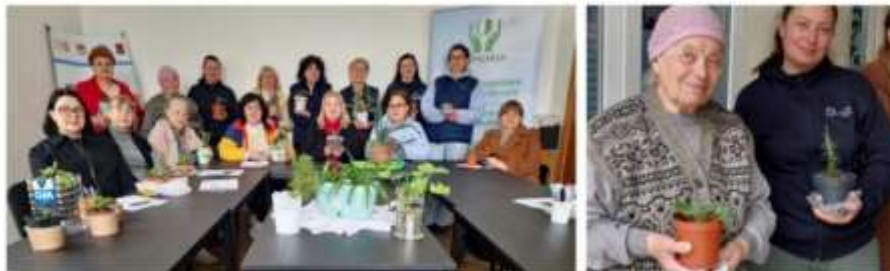
April 15, 2025 - Ecotherapy - a bridge between the soul and nature

Craft Workshops (March–April 2025) organized for 63 participants. These sessions were focused on war-related trauma, stress management, resilience and women’s rights,