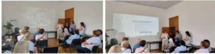
18 July, 2025 Informative session with practical elements of psychotherapy: "Panic attacks, anxiety, and cardiovascular diseases."

with 17 participants (14 women from Ukraine, 3 women from Moldova) was organized. Alternative methods of stress management based on connection with nature were discussed.