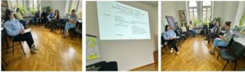
02.12.2025 - Workshop on Post-traumatic stress disorders, facilitated by experts from the Erik Holst Foundation (Switzerland) with support from ICAR Foundation (Romania)

The workshop strengthened team bonding, staff resilience, delivered efficient self-regulation tools for fieldwork, and advanced organizational prevention measures to protect staff working with deeply traumatized beneficiaries.