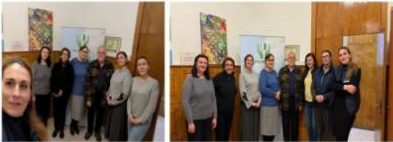
Activity performed within the project "IMPROVED REHABILITATION SERVICES FOR BETTER SOCIAL REINTEGRATION OF SURVIVORS OF TORTURE FROM MOLDOVA" with financial support of IRCT. Period of implementation 1.08.2025-28.02.2026.

On 2 December 2025, a workshop on post-traumatic stress disorder and burnout prevention was organized with experts from the “Erik Holst” Foundation, supported by ICAR Foundation (Romania). The training addressed trauma evolution, documentation of chronic and delayed PTSD, crisis management and therapeutic relationships grounded in empathy, trust and continuity of care.