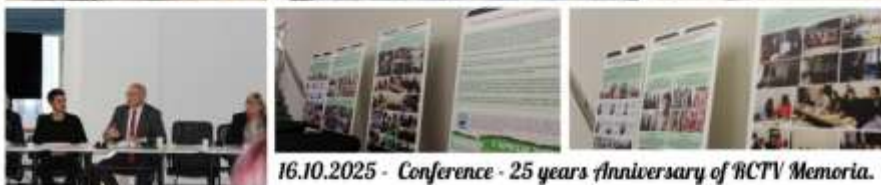
16.10.2025 - Conference - 25 years Anniversary of RCTV Memoria.