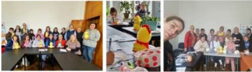
Activity organized under the umbrella of the Gender Equality Platform, with the support of Gender-Centru, which is part of a program to empower women-led organizations in their efforts to prevent and respond to gender-based violence. This initiative is supported by the United Nations Population Fund (UNFPA) and funded by the United Kingdom, co-funded by Church World Services.