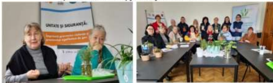
Activity organized under the umbrella of the Gender Equality Platform, with the support of Gender-Centru, which is part of a program to empower women-led organizations in their efforts to prevent and respond to gender-based violence. This initiative is supported by the United Nations Population Fund (UNFPA) and funded by the United Kingdom, co-funded by Church World Services.